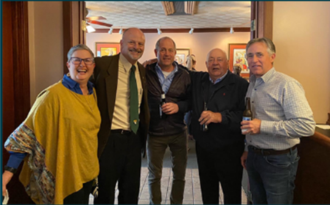
Photo from St. Louis CArEE Town Hall and Happy Hour - Spring 2023

CIVIL, ARCHITECTURAL AND ENVIRONMENTAL ENGINEERING ST. LOUIS ALUMNI TOWN HALL AND HAPPY HOUR